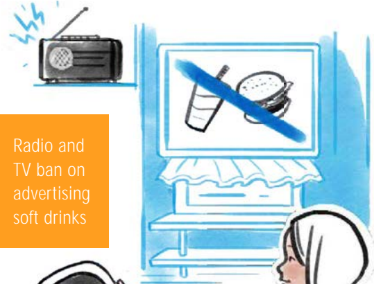
Radio and TV ban on advertising soft drinks