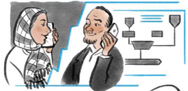
Six new COVID-19 helplines