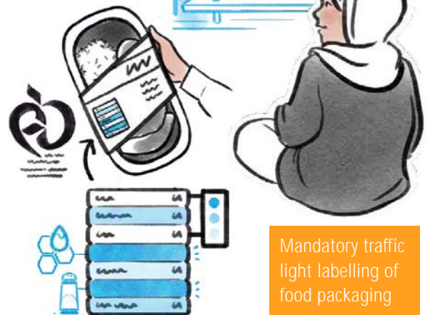
Mandatory traffic light labelling of food packaging