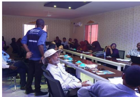
ToT training on surveillance and response for COVID-19 was held in Garowe, Puntland during March 2020