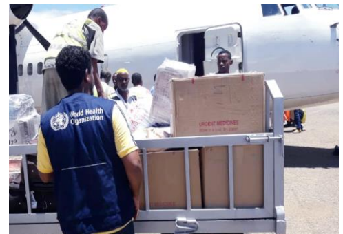
PPE and other emergency supplies for COVID-19 were delivered to the ministry of health of southwest state March 2020