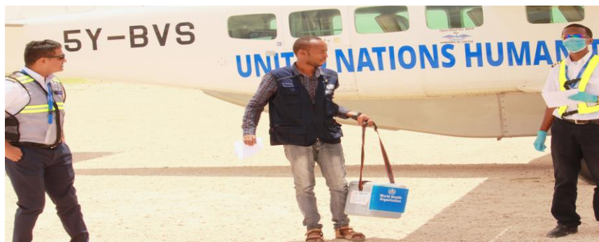
WHO supported the ministries of health of all Federal Member States to collect and ship COVID-19 samples to the designated laboratories for testing during the month of March