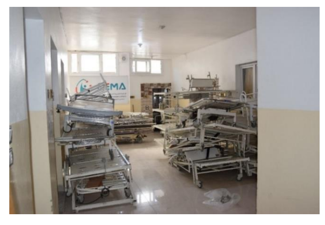
The maternity ward at Moaz Abu Madhi Maternity and Child Hospital remains empty