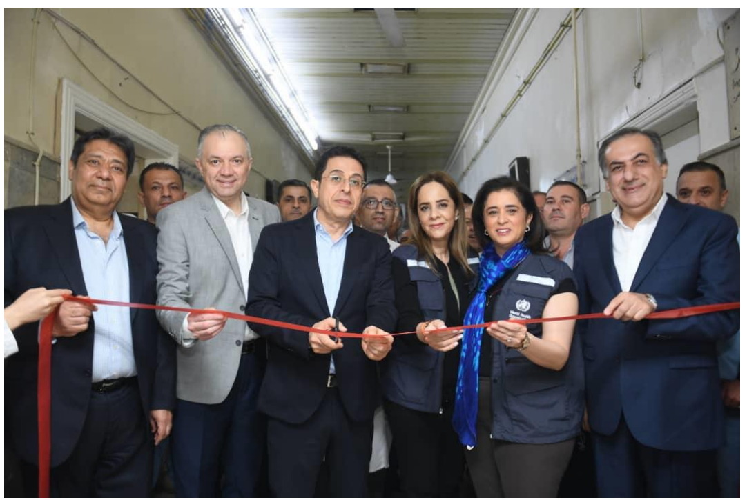
WHO Regional Director, WHO Representative, and the Minister of Health attended the official inauguration of the burns care unit at Al-Razi Hospital in Aleppo

95% of disease alerts were responded to within 72 hours