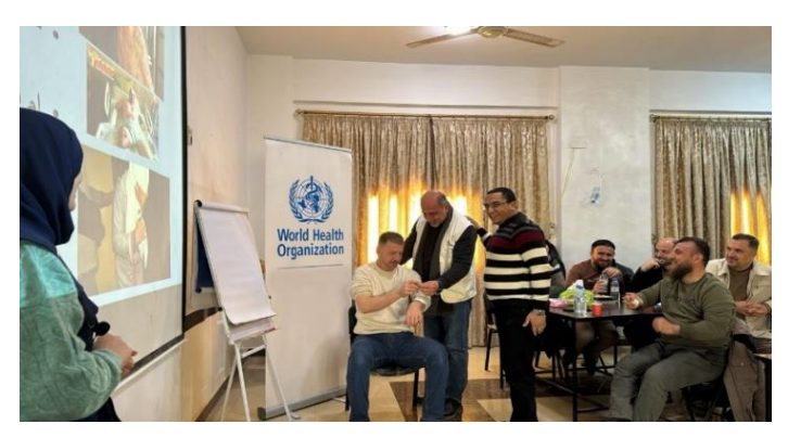
WHO staff facilitate training on burn care management in Atmeh, Idleb, northwest Syria

skills in specialized burns care. Training included several practical exercises, plus theoretical knowledge on a broad range of topics such as nursing care, surgical management, nutrition, pain management, rehabilitation, and psychosocial support.