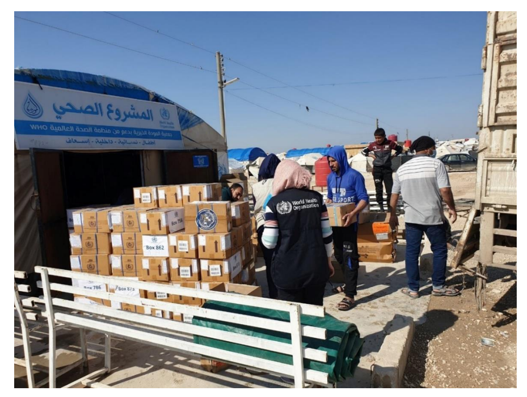
WHO marks 13 years of the Syrian crisis with renewed commitment and support

98% of disease alerts were responded to within 72 hours