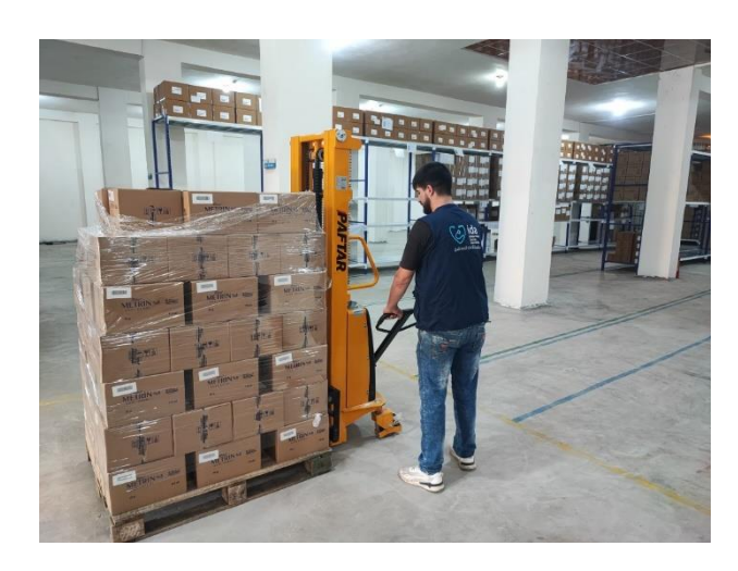
Permethrin supplied being unloaded at a WHO-supported warehouse in northwest Syria