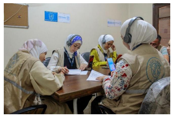
A WHO-supported implementing partner in Aleppo providing online medical consultation.