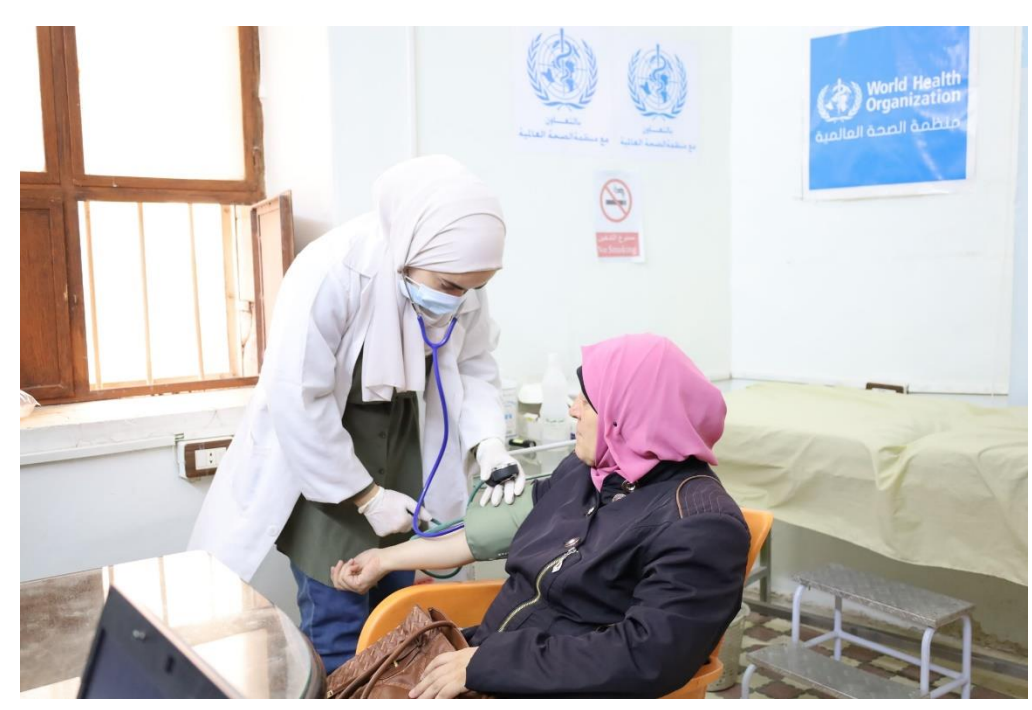
WHO is supporting the provision of primary health care services in partnership with local NGO in rural Hama

Severe acute respiratory infection (SARI) 6,626 (1.6%)