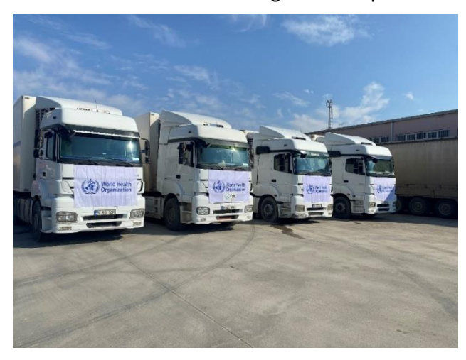
WHO transshipment into northwest Syria in February 2024

a visit to a WHO-supported in-patient rehabilitation centre in Azaz district in northwest Syria where 990 medical consultations, 2,200 physiotherapy sessions, and 1,800 psychosocial support sessions were provided following the earthquake. The majority of injuries resulting from the earthquake included spinal cord injuries, amputation, traumatic brain injuries, and orthopedic conditions requiring specialized interventions and long-term rehabilitation. In NWS, more than 23,000 people were provided with rehabilitation services following the earthquake.