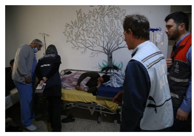
The Deputy Regional Humanitarian Coordinator for Syria and WHO head of office for Gaziantep Field Presence Office speak with patients requiring rehabilitation following landmine injuries at Ariha Specialized Hospital in Ariha, Idlib