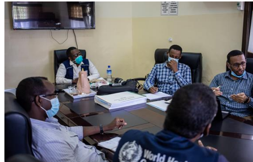
WHO and MOH held coordination meeting, discussed in how to improve communication and information sharing in May 2020