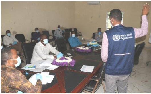
EWARN expansion training for Baidoa health facilities on 18 to 19 May 2020