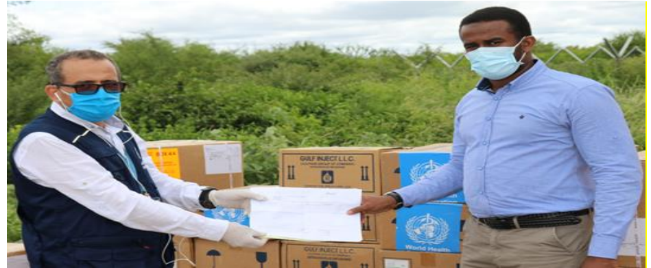
WHO handing over emergency supplies to SWS MOH on 20 May 2020. WHO airlifted life-saving medicine and other emergency supplies for flood-affected areas in SWS, Hirshabelle and Jubaland