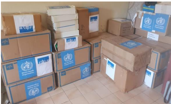
WHO providing PPEs and sample collection kits to Baidoa, Afgoye, Marka, Baraawe, Elberde and Hudur district on 28 July 2020.