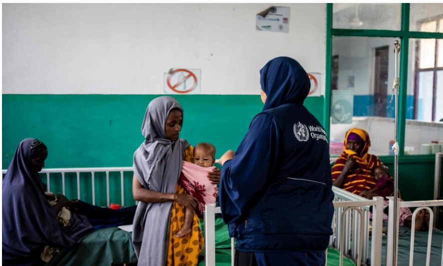
WHO PHEO is providing support supervision to Banadir Mother and child General Hospital in July 2020