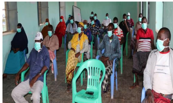
DFAs and social mobilizers training on COVID-19 awareness and prevention in Hudur District on 7 July 2020