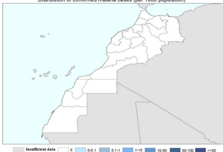
Distribution of confirmed malaria cases (per 1000 population)

Morocco is free from local malaria transmission and has 4.0% of reported cases of the malaria-free countries. The last local case was in 2004. The country was certified as malaria-free in 2010.