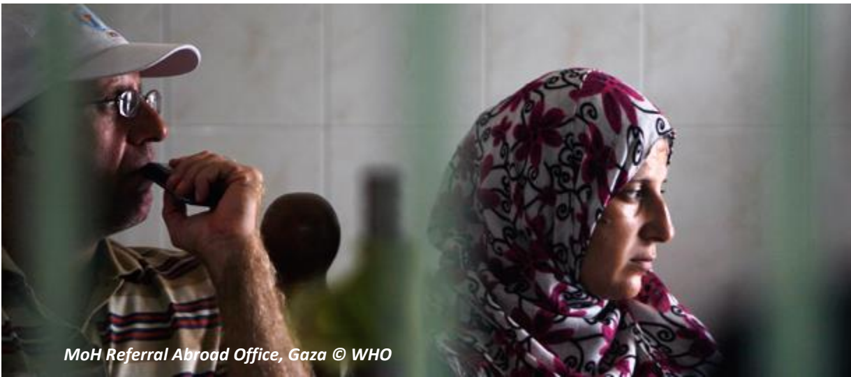
MoH Referral Abroad Office, Gaza