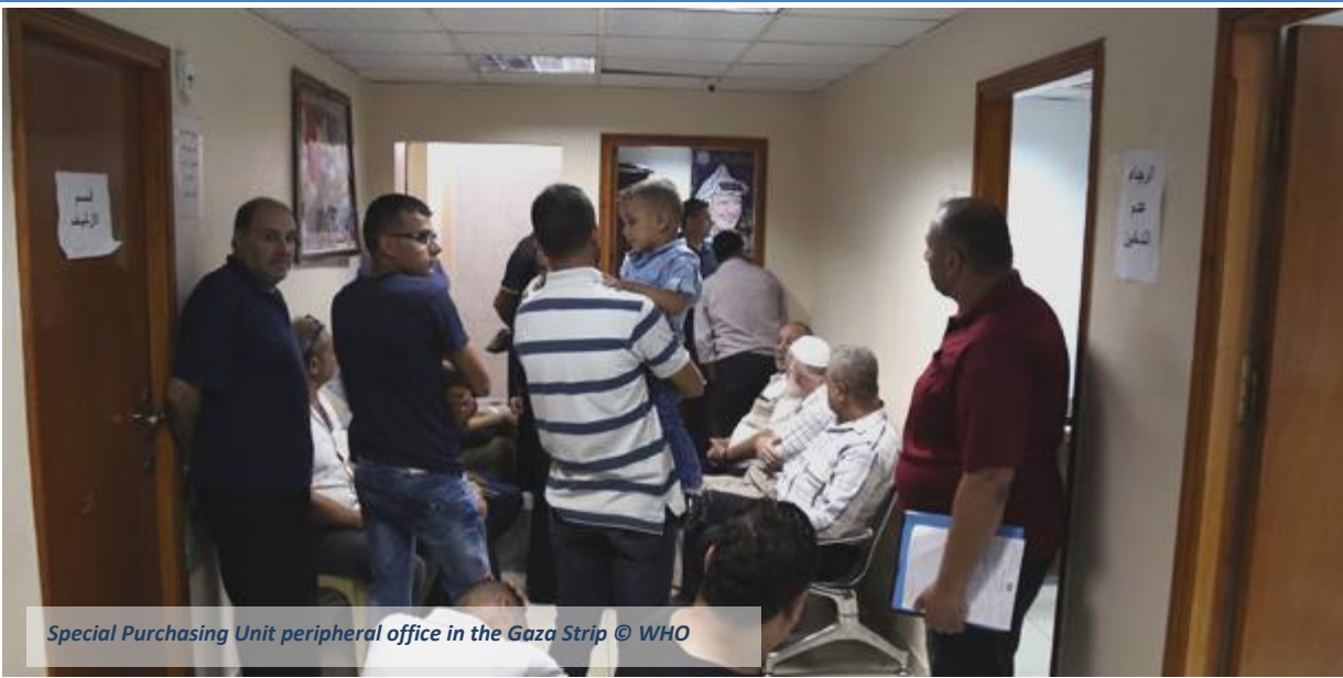
Special Purchasing Unit peripheral office in the Gaza Strip