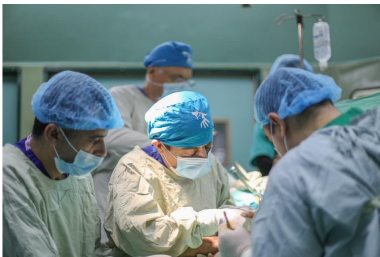
Surgeons deployed to Gaza.