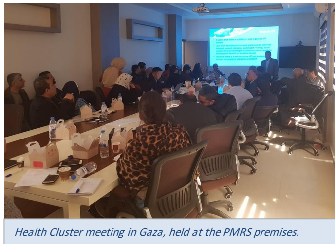
Health Cluster meeting in Gaza, held at the PMRS premises.