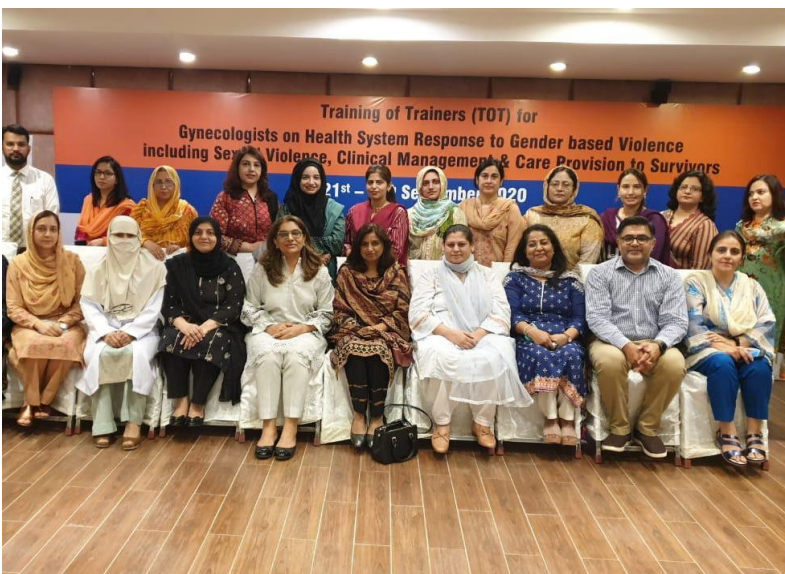
Participants of the training on health systems response to GBV in the context of COVID-19