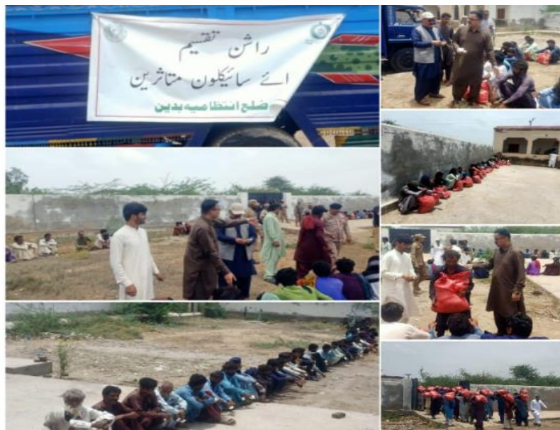
The cyclone BIPARJOY evacuees receiving relief items in Badin, Sujawal, and Thatta districts.