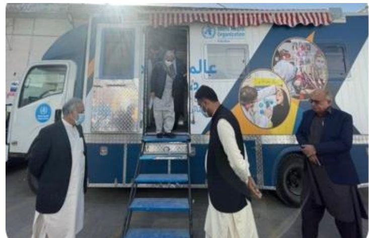
WHO Mobile vans deployed in Tharpark, Badin and Thatta supporting medical camps activities.