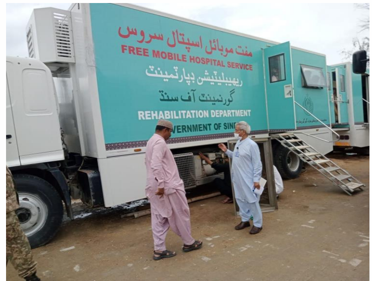
Mobile Hospital Services deployed at affected district from Rehabilitation Department, Government of Sindh