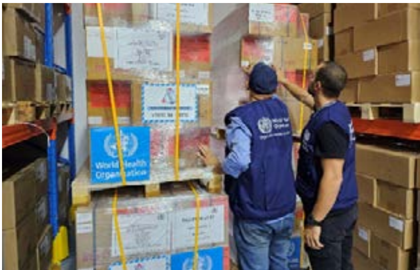
The delivery of supplies from WHO Dubai Hub to MoPH Central Drug Warehouse