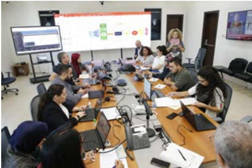
Daily PHEOC meeting at MoPH on Thursday, October 26th