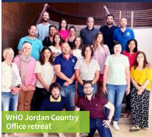
WHO Jordan Country Office retreat