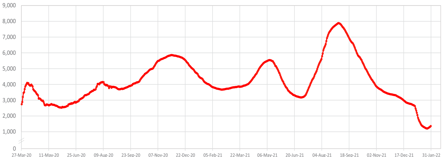
Figure 2 - COVID-19 Patients in Intensive Care, 26 March 2020 - 30 January 2022

Number of cases admitted to ICU: 1,404 ↑(+42)