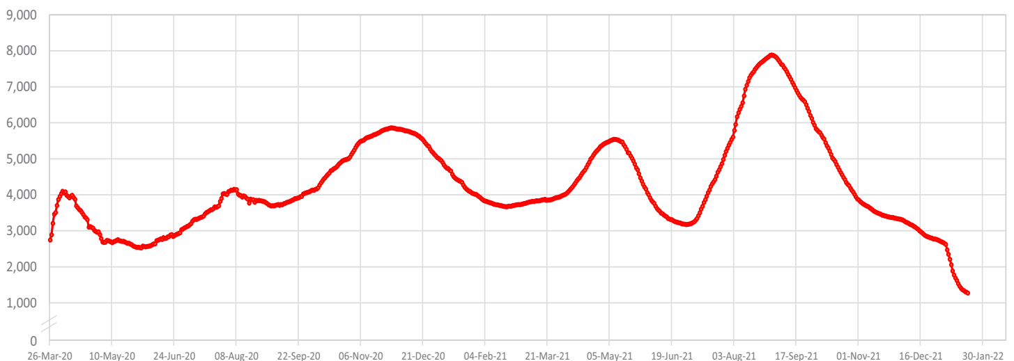
Figure 2 - COVID-19 Patients in Intensive Care, 26 March 2020 - 19 January 2022

Number of cases admitted to ICU: 1,271 ↓(-24)