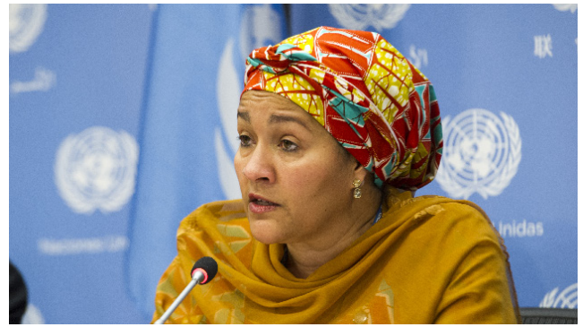
Ms. Amina Mohammed

The RHA also links with the Arab States UN Regional Collaborative Platform through the Issue-based Coalition on Inclusive Social Services and which WHO is a co-convener with UNESCO.