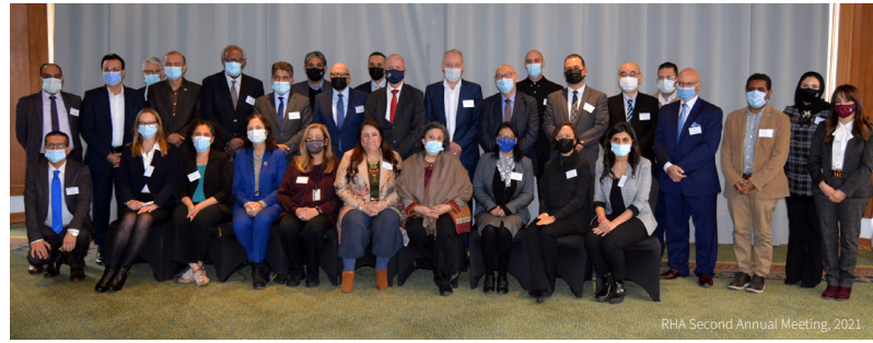
RHA Second Annual Meeting, 2021