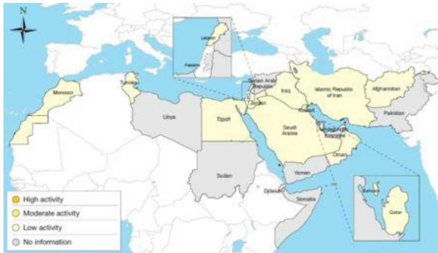
Fig. 1. Influenza activity in the Eastern Mediterranean Region, May 2017

In the WHO Eastern Mediterranean Region, influenza activity remained low in May in countries reporting data to FluNet and EMFLU namely, Afghanistan, Bahrain, Egypt, Iran (Islamic Republic of), Iraq, Jordan, Morocco, Oman, Qatar, Saudi Arabia, and Tunisia (Fig. 1). All seasonal influenza subtypes were detected in the Region.