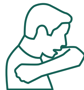
Sneezing or coughing into a folded arm