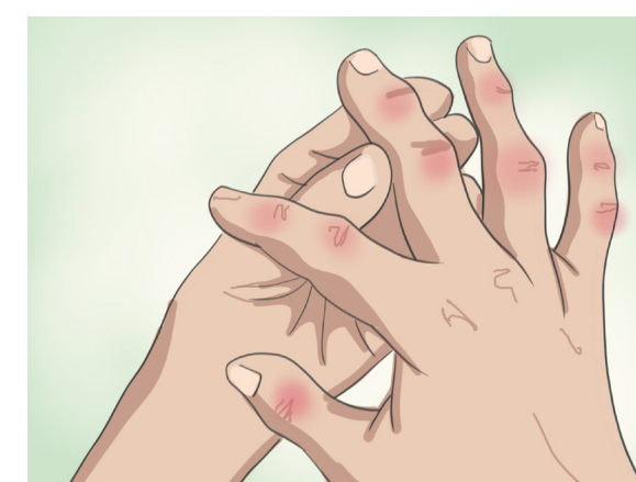
Muscle and joint pain