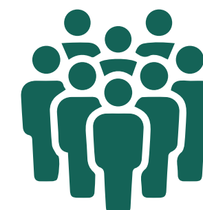
Avoiding crowded and non-ventilated places