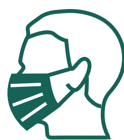
Wearing a mask