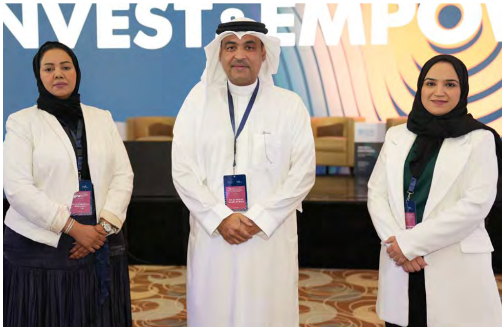
The Bahrain delegation and WHO Representative, Bahrain, participate in the "Second High-level Tri-Regional Meeting on Refugees and Migrants' Health", 16-17 March 2023, Sharm El Sheikh, Egypt

The meeting aimed to move forward the implementation of the strategic priorities agreed at last year's high-level meeting