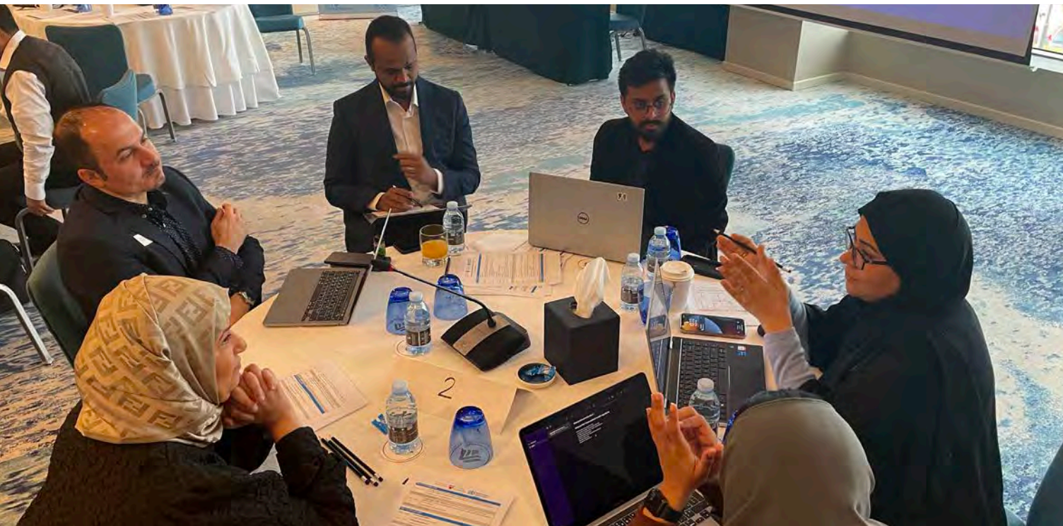
Participants engaging with the EMRO facilitator in the simulation exercise training of trainers, 20-22 February 2023, Manama, Bahrain

“ The Simulation Exercise came at the right time. Building on the momentum of the global response to the COVID-19 pandemic, strengthening knowledge and improving skills . . . [are] important to continue developing national preparedness in the face of emerging infectious or non-infectious health threats. The exercise itself is well structured, allowing for flexibility in terms of broadening participant thinking in how to address the development of a roadmap to better tackle emerging events. ”