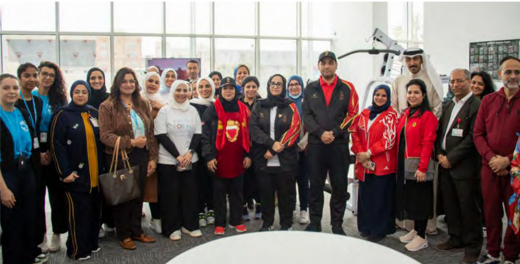
The WHO Country Office join the Ministry of Health in celebrating Bahrain Sports Day, 9 February 2023, Manama, Bahrain

The WHO Country Office joined the Ministry of Health in celebrating Bahrain Sports Day, which is observed annually on the 9th of February to raise awareness