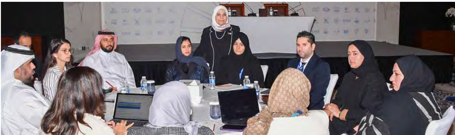
Dr Tasnim Atatrah, WHO Representative, Bahrain, leads the stakeholder consultation on health as part of the preparations of Bahrain's second Voluntary National Review, 13 February 2023, Manama, Bahrain

The VNR report has been finalized and shared with the Cabinet in May 2023 to be endorsed before its presentation at the HLPF in July 2023. The draft report provides an evidence-based review of Bahrain's progress in implementing the Sustainable Development Goals since the submission of the first VNR in 2018, showcasing national achievements in a number of areas, including health, education, and economic diversification.