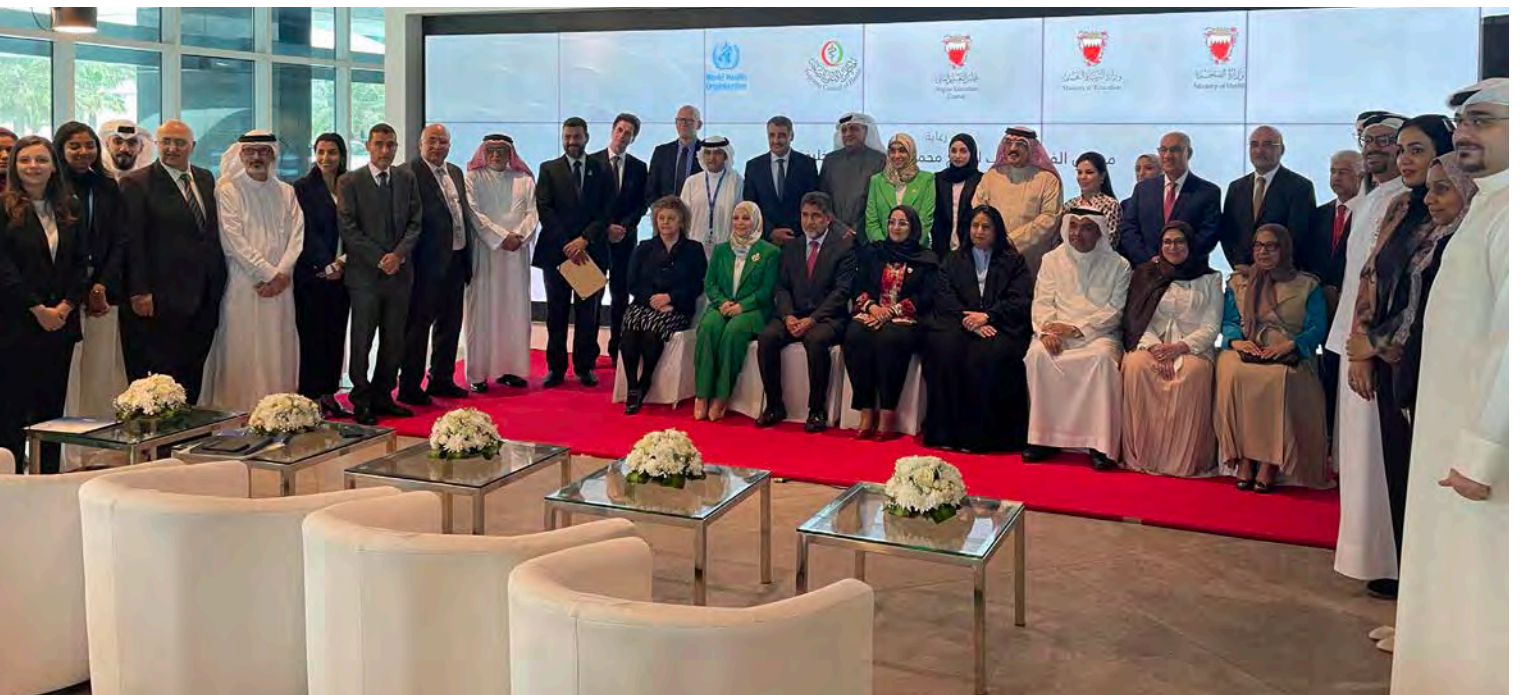
Awarding ceremony of the WHO Health-Promoting Universities, 26 February 2023, Manama, Bahrain