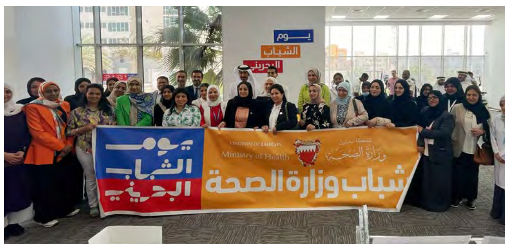
The WHO Country Office join the Ministry of Health in celebrating Bahrain Youth Day, 25 March 2023, Manama, Bahrain

The celebration was inaugurated by HE Dr Jaleela bint AISayed Jawad Hasan, Minister of Health, and it brought together key government officials, youth