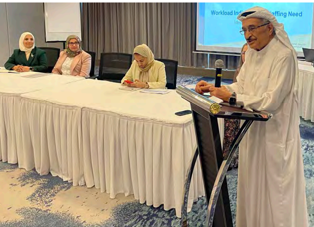
HE the Chairman of the Supreme Council of Health inaugurates the WISN workshop, 26-30 March 2023, Manama, Bahrain