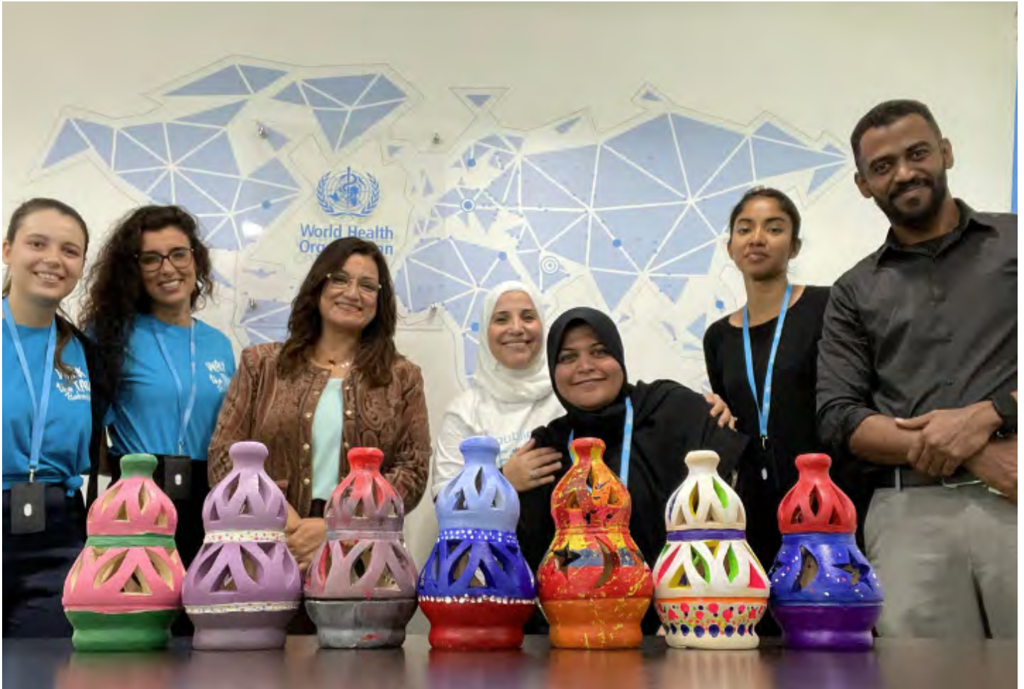
The WHO Country Office participates in a wellness activity with the Regional Staff Physician as a pre-celebration to Ramadan, 1 February 2023, Manama, Bahrain