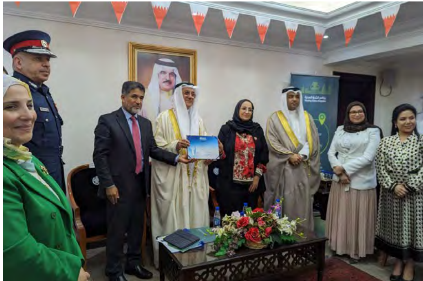
A'ali is awarded the Healthy City status, 26 February 2023, Northern Governorate, Bahrain