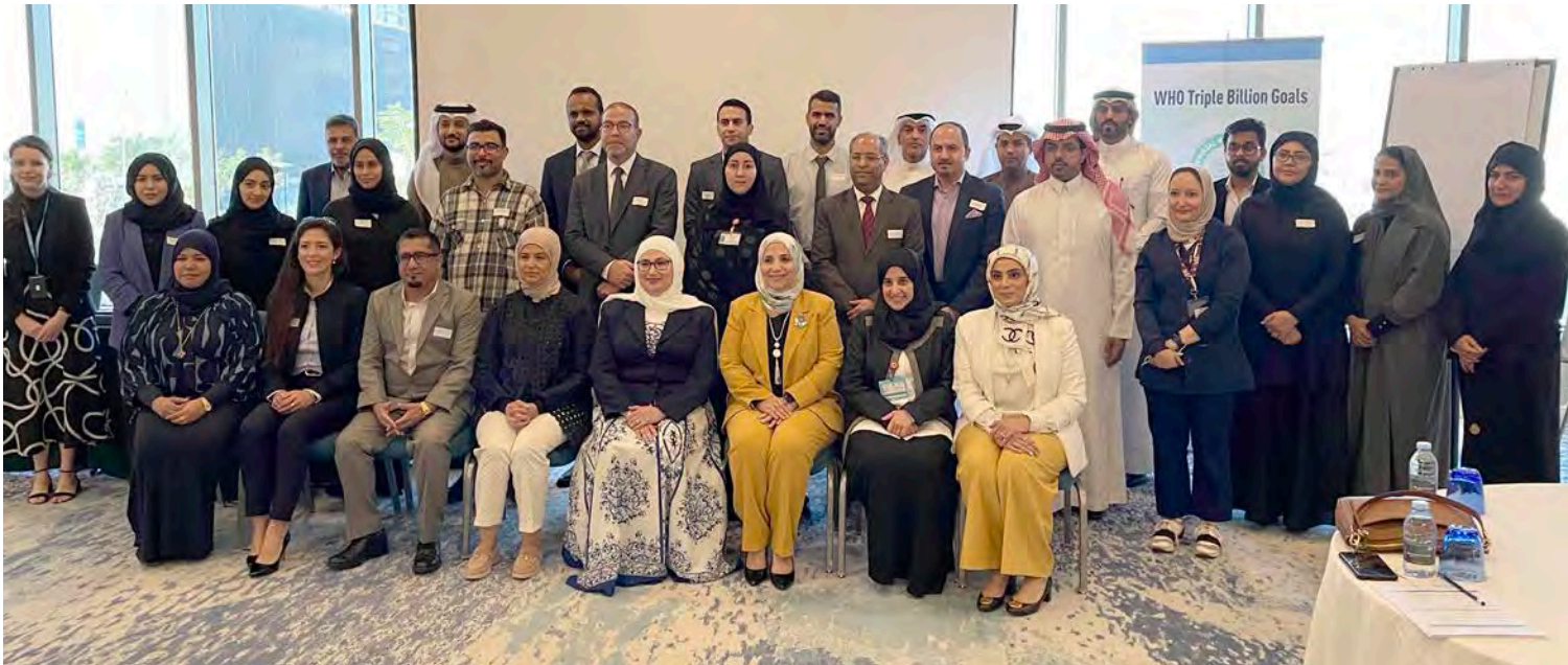
Group photo of the experts participating in the simulation exercise training of trainers, 20-22 February 2023, Manama, Bahrain