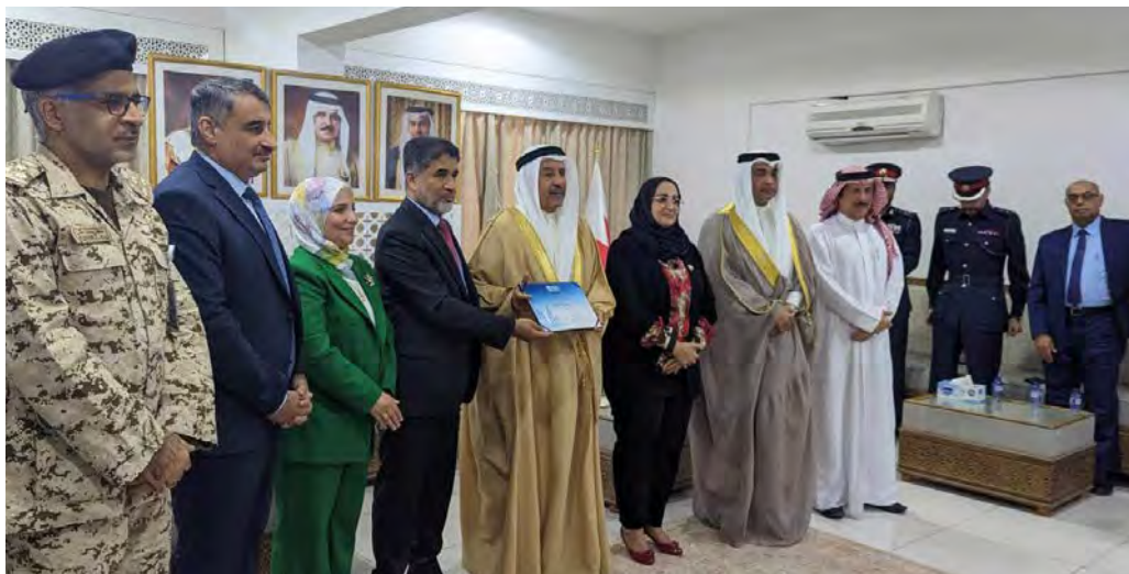
Busaiteen/Al-Sayah is awarded the Healthy City status, 26 February 2023, Muharraq Governorate, Bahrain