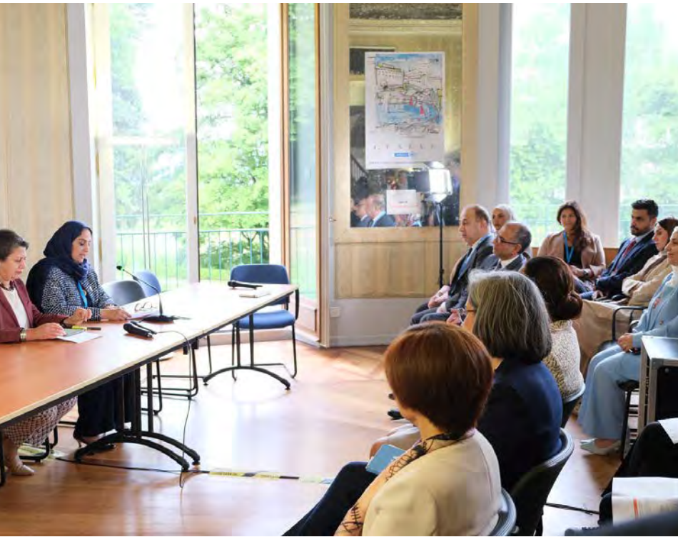
HE Dr Jaleela bint AlSayed Jawad Hasan, Minister of Health, launches the side event on “The WHO acceleration plan to stop obesity: from endorsement at WHA75 to execution in frontrunner countries”, 21-30 May 2023, Geneva, Switzerland