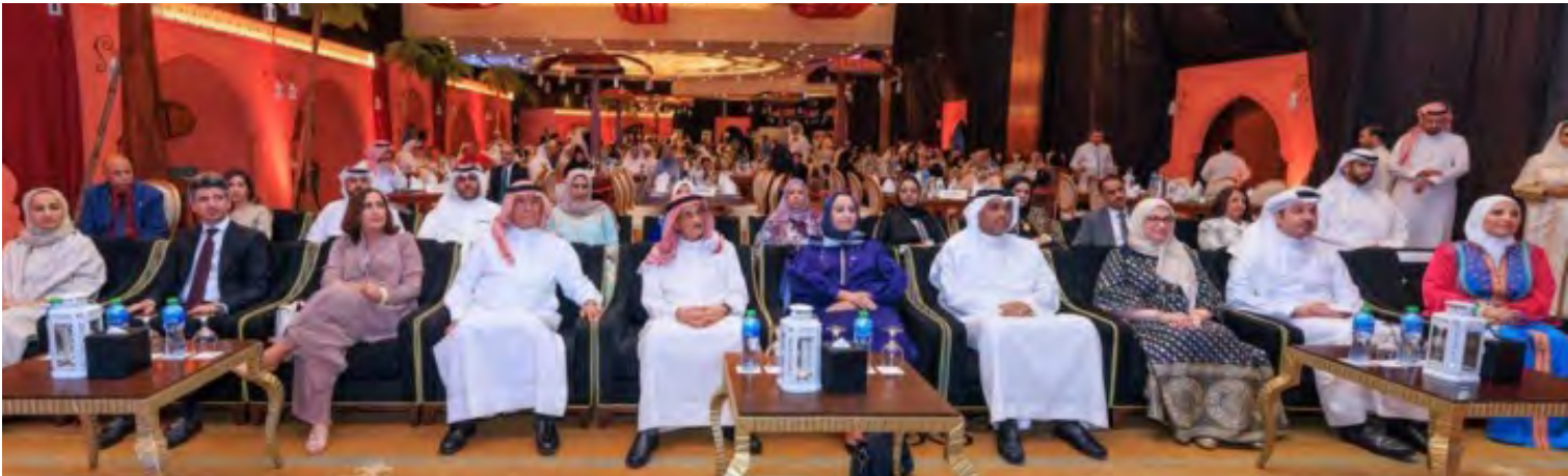
The WHO Country Office join the Ministry of Health in celebrating World Health Day, 7 April 2023, Manama, Bahrain

The WHO Country Office in Bahrain joined the Ministry of Health and the international community in observing the World Health Day, which is celebrated globally on the 7th of April every year to mark the anniversary of the founding of WHO in 1948. Coinciding with the 75th anniversary of WHO, this year's World Health Day provided an opportunity to look back at the public health successes that