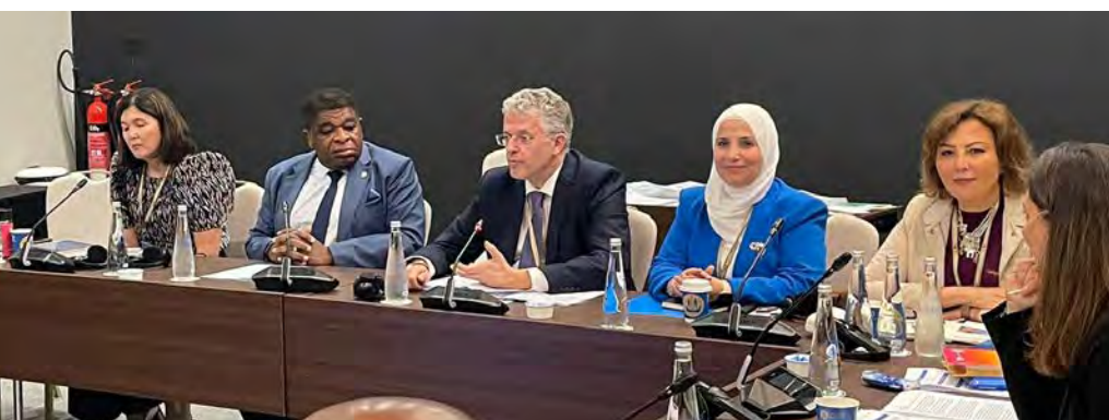
WHO Representative, Bahrain, engaging in discussion at the 146th Assembly of IPU in Bahrain 11-15 March 2023, Sakhir, Bahrain

The 146th Assembly of the Inter-Parliamentary and its associated meeting delivered a resonant message on how the long-standing partnership between WHO and IPU to enhance parliamentary engagement is now more important than ever to ensure healthy lives and promote wellbeing for all throughout life.