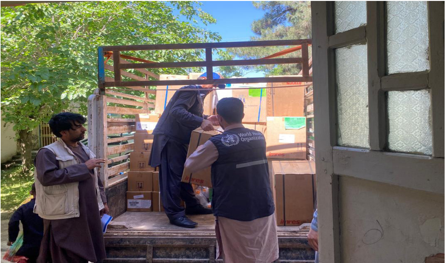
WHO medical supplies reach affected areas in northern Afghanistan on 11 May 2024.