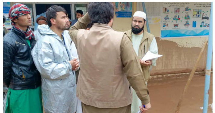
Flooding in Baghlan, northern Afghanistan, on 11 May 2024.