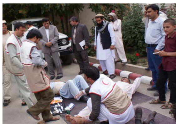
A WHO-supported first aid training simulation was conducted by ARCS trainers for community health workers