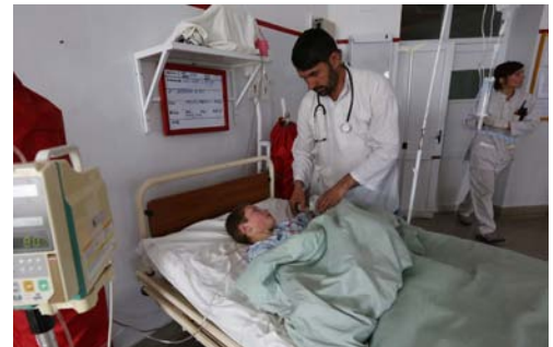
A boy injured during the avalanche in Panjshir province is treated in the EMERGENCY hospital

A nationwide measles immunization campaign has been planned and will be conducted in Afghanistan in April 2015