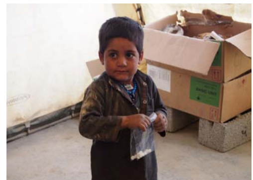
This boy received medicines to treat his respiratory infection at the WHO-supported Bagrami IDP camp mobile clinic run by SHRDO