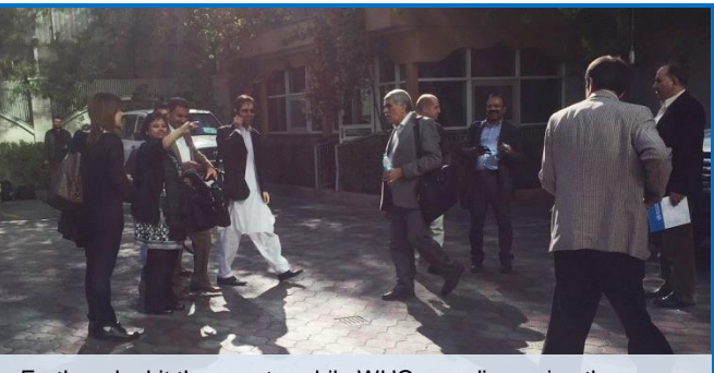
Earthquake hit the country while WHO was discussing the national health emergency response plan with MoH and partners.